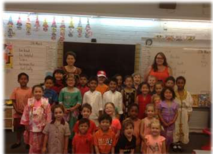
Our 1M Class celebrating Harmony Day